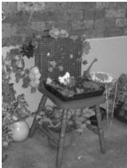
Margaret Goodwin's garden seat.

It had been threatening to rain all day, but the weather was kind to us. Tables and chairs were dotted about the garden and everyone was chatting among themselves,