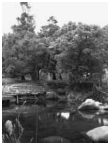
A quiet corner near the dam in Tania's garden.

My first stop is at Tania Brown's three and a half acre park-garden behind the cheese factory in the sleepy hollow of Tataraimaka. The Timaru River enfolds it on three sides and everywhere I go there are the sounds of tumbling water and singing birds. The