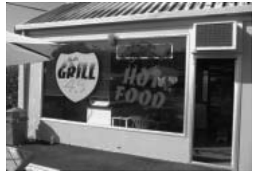
The revamped fish shop.