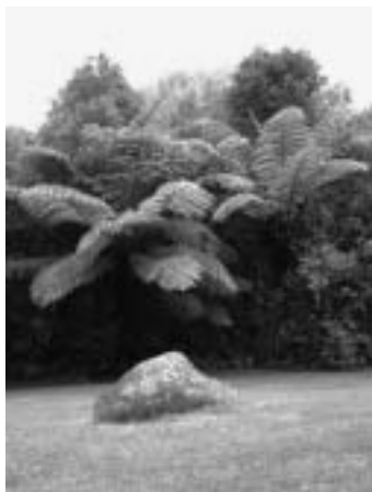
Pongas provide the bookdrop for a river shaped boulder.

background traffic noise seems simply to remind me that I'm taking time out from my "real world". While cared for lovingly, the garden is not too restrained. Maples, scattered throughout the garden, are testament to Tataraimaka's microclimate. There's a stage/retreat complete with stone-circle fireplace down by the river and a lone, river-sculpted boulder, a drop in the pool of mown grass surrounding it. A rarely trodden path leads to the dam that once supplied water to provide power for the factory and there's a lovely stand of native trees on the other side. Further on, I dangle my legs over the edge of a little bridge and watch the water below me tumble over a little waterfall and down miniature rapids. When I finally encounter Tania again, she tells me she was thinking of sending out a search party. I tell Tania she must think she's in heaven!