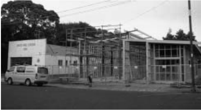
Station renovations well under way.

Talk of perseverance takes us to the building site. Have you seen the progress? From the photo you will see how much has happened since work commenced after the holiday break. It is looking pretty impressive and of considerable size.